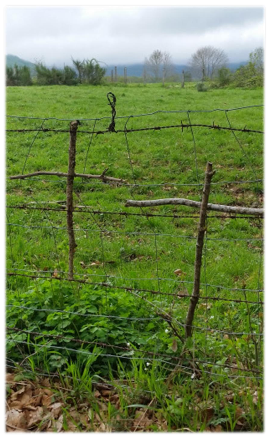
Pilgrim crosses on fence between Roncesvalles and Zubiri, Spain Camino de Santiago